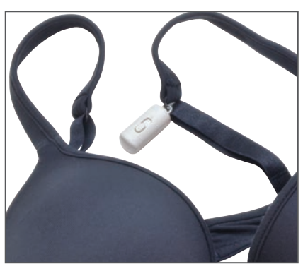
Straps of Lingerie and Swimwear